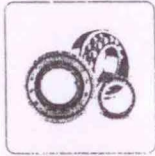
Bearings & Units

is an Authorized Industrial Distributor for SKF Products and Services